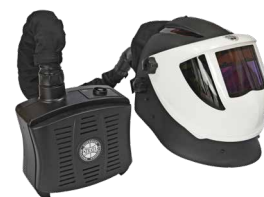
DW7000XL comes with battery powered air respirator.